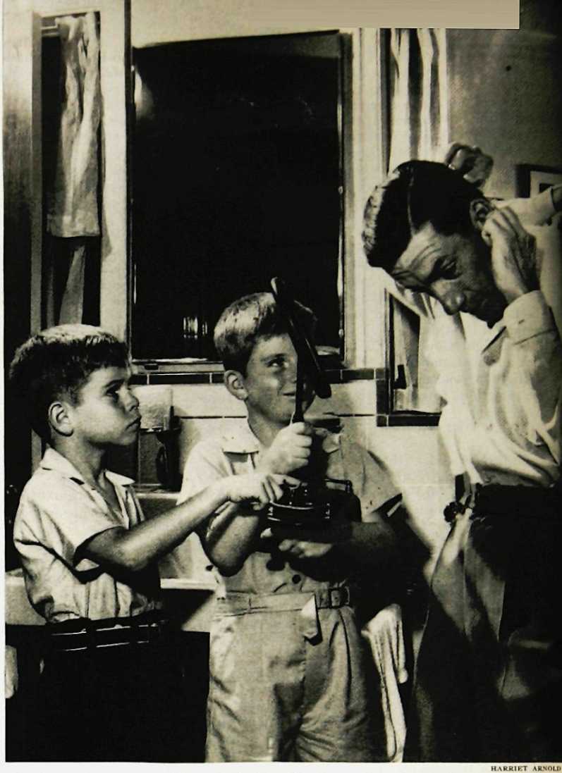
A rebel against many things, including "barbers who cut your hair too short in back," the star-dust man trims his own-as well as that of his two sons, above.